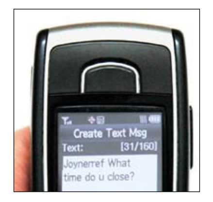
The patron-side cell phone view and the librarian-side instant message window.

Several commercial solutions allow libraries to provide text messaging reference service. One is Altarama Information Systems, an Australian company that supported one of the first libraries to offer text messaging reference service. Altarama uses redcoal.com, a provider of wireless Internet and mobile messaging products, to provide text messaging numbers and the means to convert SMS messages into e-mail and vice versa. Users send a text to the Library's dedicated number, the text is converted into an e-mail that appears in the reference desk inbox; the Library replies via e-mail; and the reply is converted back into a text message that is sent to the users' cell phones. In 2005, the Sims Memorial Library at Southeastern Louisiana University began a "Text-a-Librarian" service using funds from a Technology Fee grant.<sup>3</sup> In spring 2008, a similar system of converting a text message into