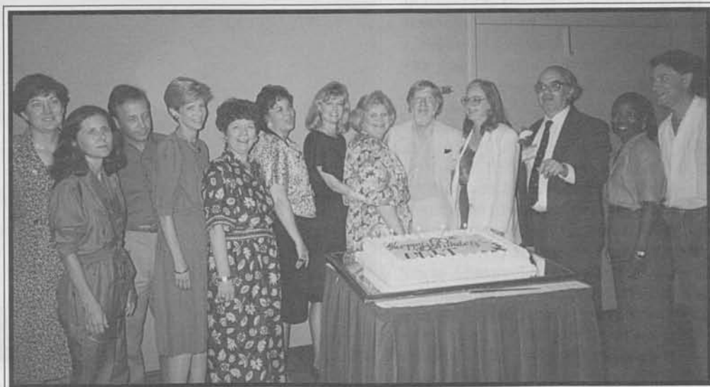
NMRT Social, "Celebrating 60 in High Style," marked the sixtieth anniversary of the round table, July 1, 1991.