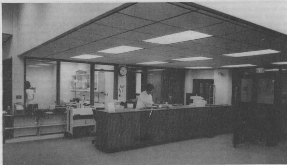
The circulation desk and work areas.

time employee. Staffing expanded to include two professional librarians and two pages. A children's librarian was among those hired, allowing the Clemmons Branch to offer services to children for the first time. Along with the new building and additional personnel, the branch was also given a one-time-only book budget of $27,500 for fiscal year 1984-85. This sum will go a long way toward meeting the demand for reading material created by the new building. The Clemmons Branch had roughly eleven thousand volumes before the move into new quarters, which will house up to forty thousand books.