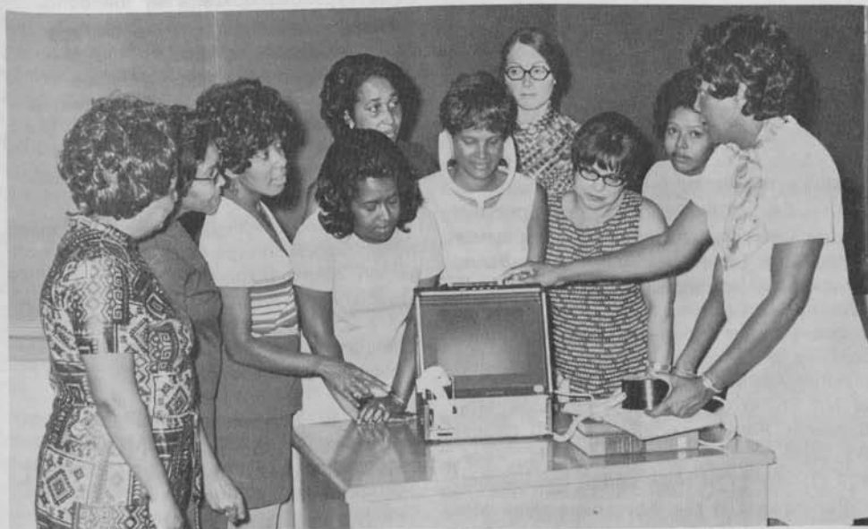
1971-72 Carnegie and office of Education Fellows, Early Childhood Library Specialist Program (NCCU)