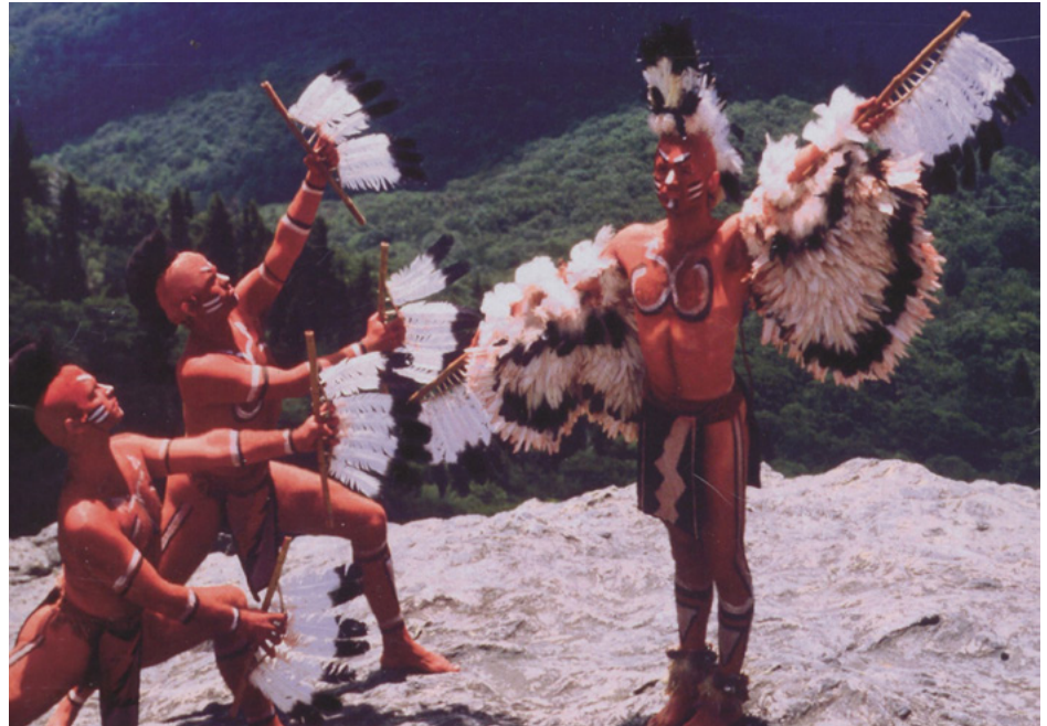
Figure 3: Detail from “Unto These Hills” Souvenir Program, 2005