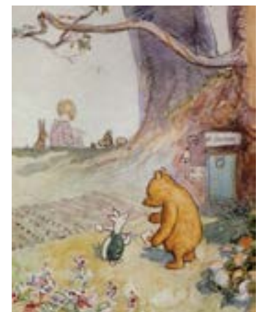
Milne and Shepard, Winnie the Pooh , Methuen 1926