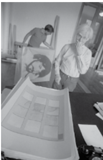
Andy Warhol.

US Copyright Act, in 1790, provided for a term of 14 years, with a 14-year renewal available, and at various times those terms have gotten longer, to 28 years with renewal, and after the US determined to join the Berne Convention, copyright term changed from a specific number of years to the number of years after the death of the author. Today’s US copyright term for works that are not “works for hire” is “life of the author + 70 years,” a term that was codified in the Sonny Bono Copyright Term Extension Act in 1998. 4 In part because of these changes in US law, knowing when a work enters the public domain can be confusing. The Digital Copyright Slider is one tool that can help. 5