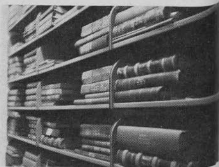
This view shows a section of shelving inside the vault which houses many valuable Quaker materials. Because of their size and delicate condition, volumes stored in the vault are placed on their side much like the codices of ancient libraries.

The claim to such singularity stems from the nature of the college itself. Guilford College is the only college in the South which is affiliated with the Society of Friends, or Quakers, as members of the Society are known to many. In the nation there are less than a dozen colleges which have special Quaker collections similar to the one at Guilford College. These colleges are all Quaker institutions located in New York, Pennsylvania, Indiana, Ohio, Iowa, Kansas, and Oregon. "No denomination has been more careful of its records or more interested in preserving its literature than have Friends. Thus, the normal Quaker college has a large deposit of its own books and records to care for." 2