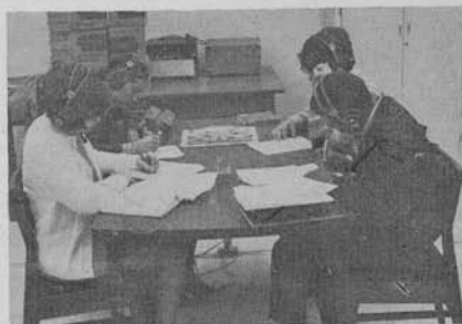
Audio Room at Mary Livermore Library at Pembroke State University.