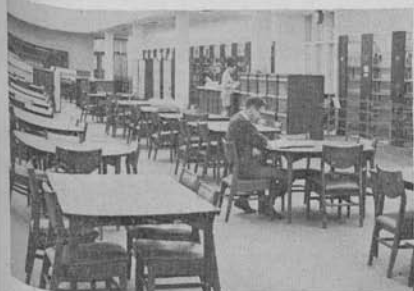
Main reading room at Mary Livermore Library at Pembroke State University.