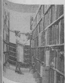
Mary Livermore Library at Pembroke State University.