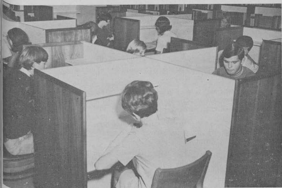
Reading Carrels at Mary Livermore Library at Pembroke State University.