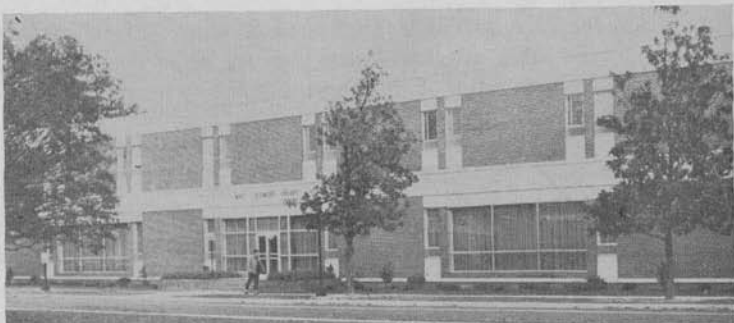
Mary Livermore Library at Pembroke State University.