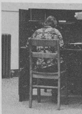
Wet Study Carrels Employ New Educational Technology