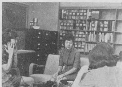
East Carolina's library science students make use of library materials

to transfer also to the new program. The new degree program permits students to gear their training toward the type of library, school, public, or college and university, in which they are most interested. At present, the department is still making available the old degree, Master of Arts in Education with a Library Science major. Many undergraduates have transferred from the General College program this fall into the Bachelor of Science program also which includes a quarter of internship in a school library under the supervision of a professional librarian.