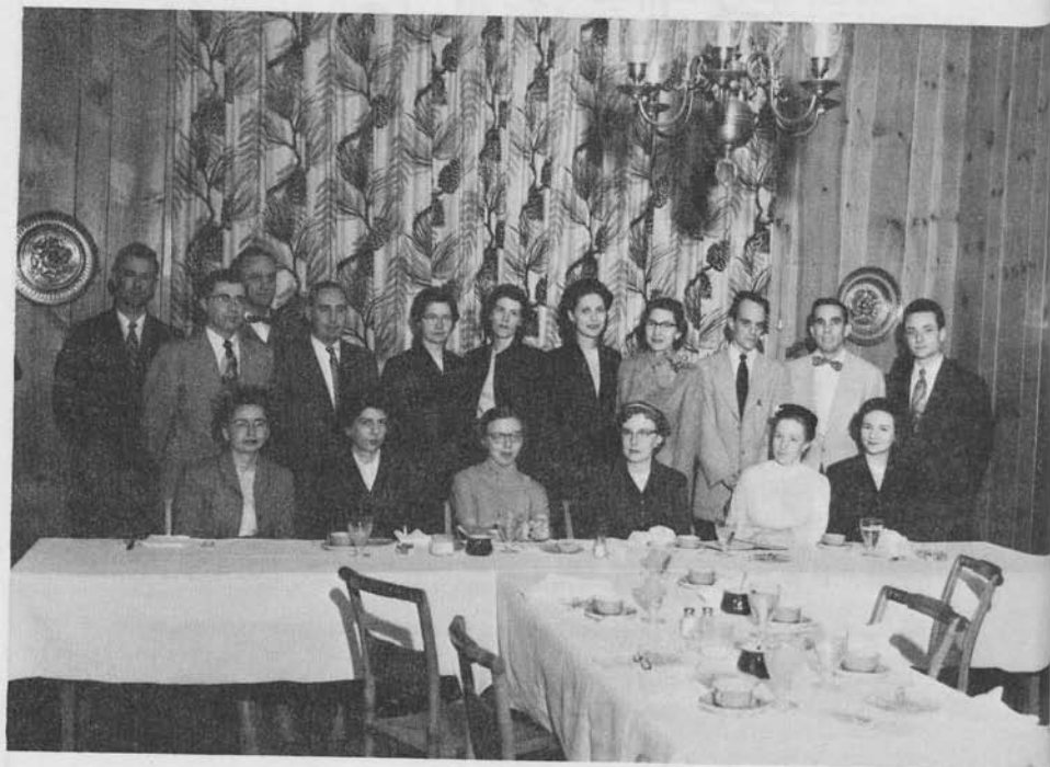
Junior Members, NCLA, February 19, 1955. (If you have difficulty identifying them, turn to p. 55).