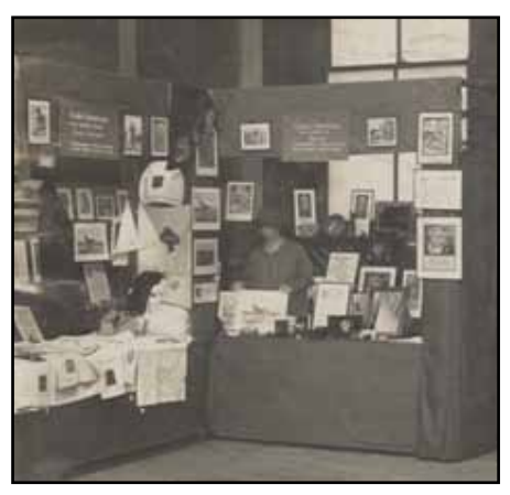
Cuala Industries booth at an undated Belfast exhibition

As the cards were removed, I made archival envelopes to protect the loose cards and to keep them in small batches for scanning. Because we had used our book scanner to create an electronic version of the Cuala Press sample book, we had a photographic verification of their original order. This record allowed us to safely remove these cards.