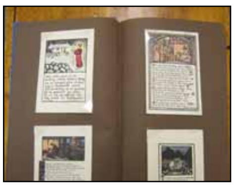
A page from the restored sample book