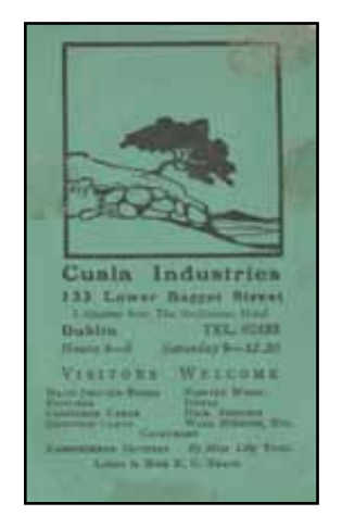
Cuala Industries business card