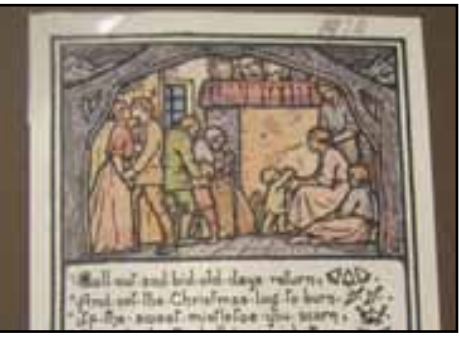
One of the Cuala Press cards