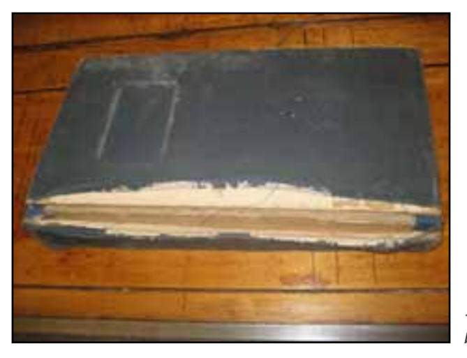
The Cuala Press sample book before restoration

uring the summer of 2010, a colleague brought me what appeared to be an old scrapbook. This scrapbook was in poor condition with a torn spine, worn cloth cover and acidic pages.