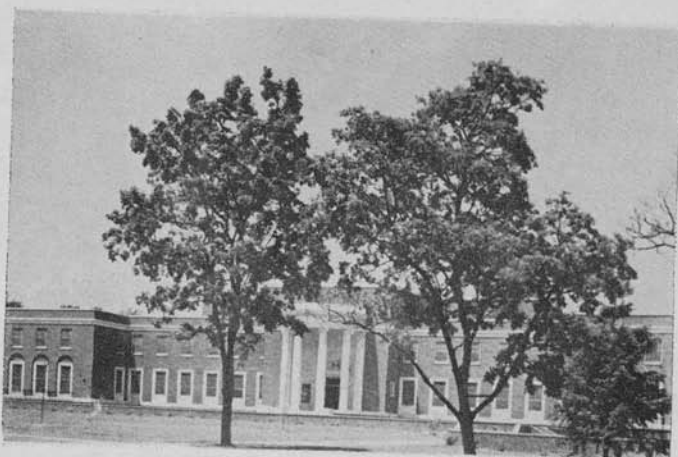
The Library, Woman's College of the University of North Carolina, Greensboro, N. C.

During the past couple of years just preceding 1952, there were over a half-dozen major library building projects completed.**