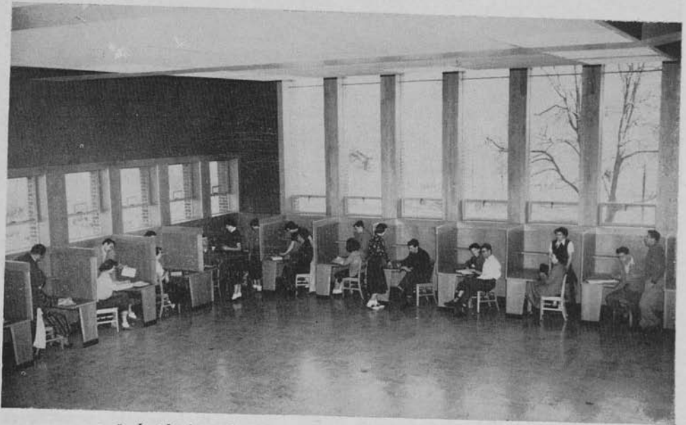
Individual study carrels, Library, W.C.T.C., Cullowhee. (Stacks and furniture have not been received.)

Elizabeth City State Teachers College has plans completed for an $85,000.00 addition to their building which will give them a seating capacity of 450, and a book capacity of 125,000. Other colleges that have a real need for a new library but have not as yet made definite plans are: Queens College, Meredith College, St. Marys, and Mars Hill.