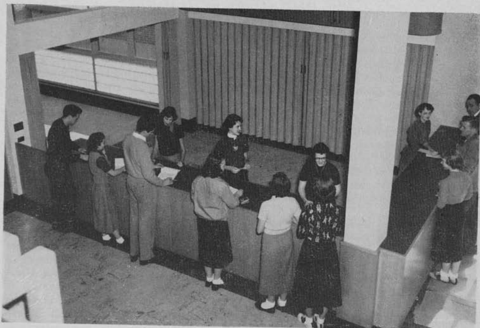
Circulation desk, Library, W.C.T.C., Cullowhee. Sliding-door partition hides stack-room; door to left opens into cataloging department, can be closed with sliding-door partitions.

As so many of these new buildings are just being completed or will not be finished until 1953 and early 1954, the total significance of the recent building programs cannot as yet be assessed. Colleges and universities in North Carolina, however, are laying the foundations for strong library programs. The announcement of dedicatory gifts of over a million dollars in books and other materials by the University of North Carolina is an indication of the enrichments of library resources which follows in the wake of providing facilities for housing. Programs which included not only facilities for the college and campus clientele, as at Western Carolina Teachers College, but also a cultural center for people of the county and the region, are indicative of the concept of added services which these new library buildings are going to give students and scholars of the state.