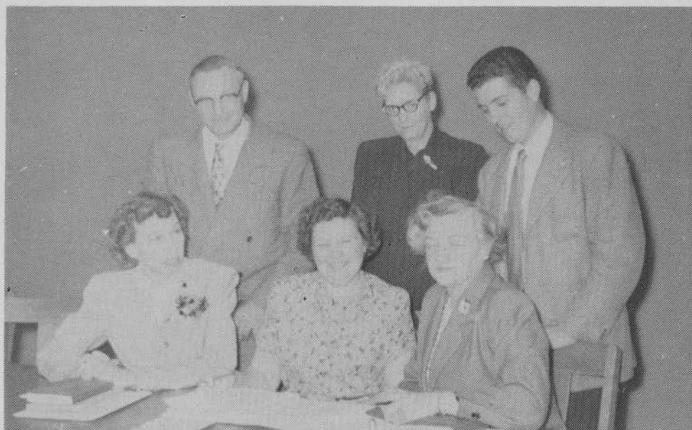
INTERIM EDITORIAL BOARD