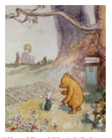
Milne and Shepard, Winnie the Pooh, Methuen 1926

44 North Carolina Libraries Volume 80 2022/23