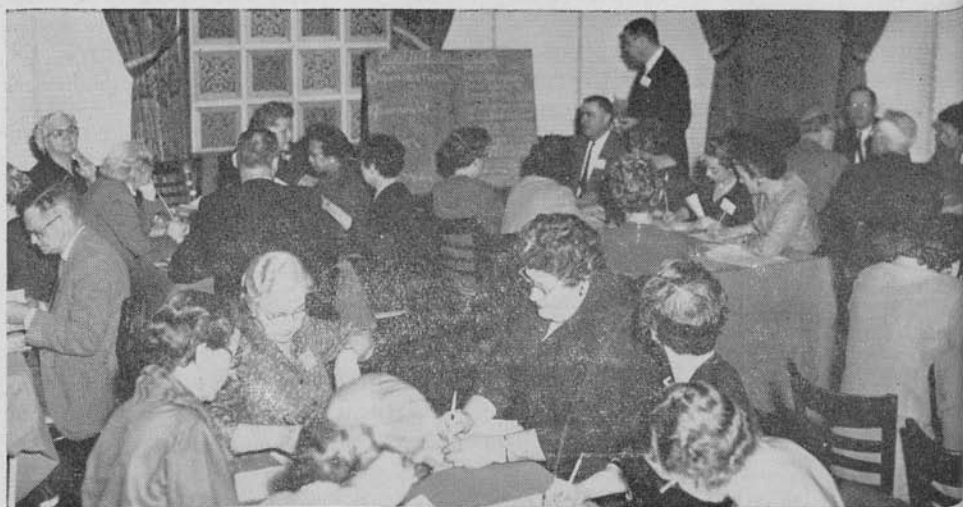
Librarians and trustees at the Library-Community Project Institute developing program ideas to meet community educational needs.