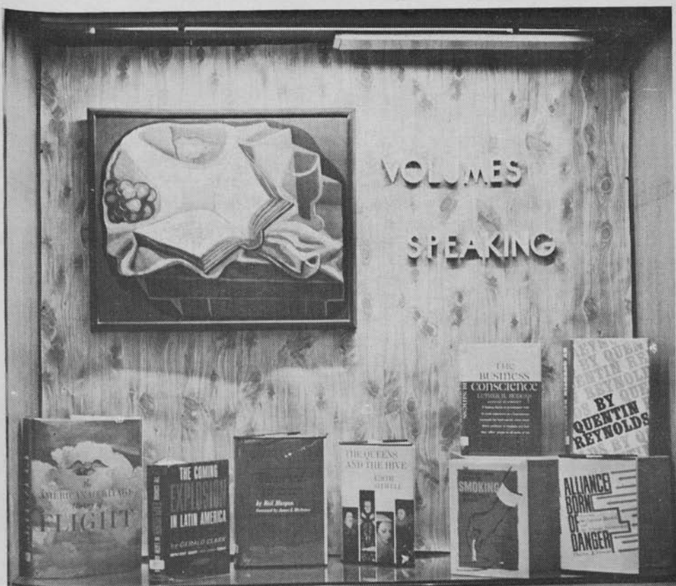
Small exhibit case in back of circulation desk, Walter Clinton Jackson Library, U.N.C. at Greensboro. The framed picture is from the rental collection.

The answer, of course, is any subject if attractively and interestingly presented, preferably a topic or aspect supplementing his classroom lectures. He has enough of those, and also very few extra hours for personal reading. The insistent clamor of the new book proclaiming, "Read Me!" has little relevance for the college student, although it may exert appeal to some faculty and faculty wives. College library emphasis, unlike