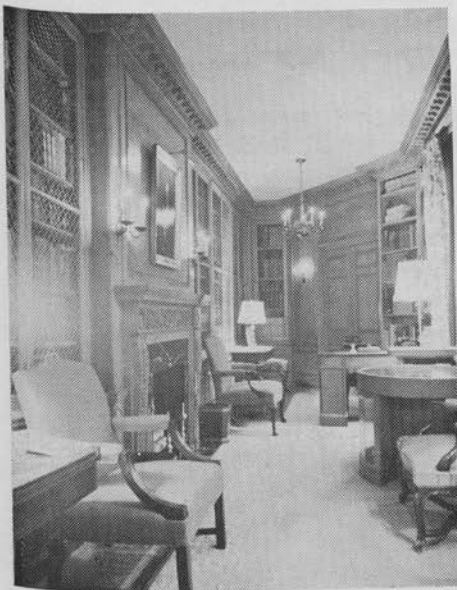
The Trent Room, Medical Center Library, Duke University.