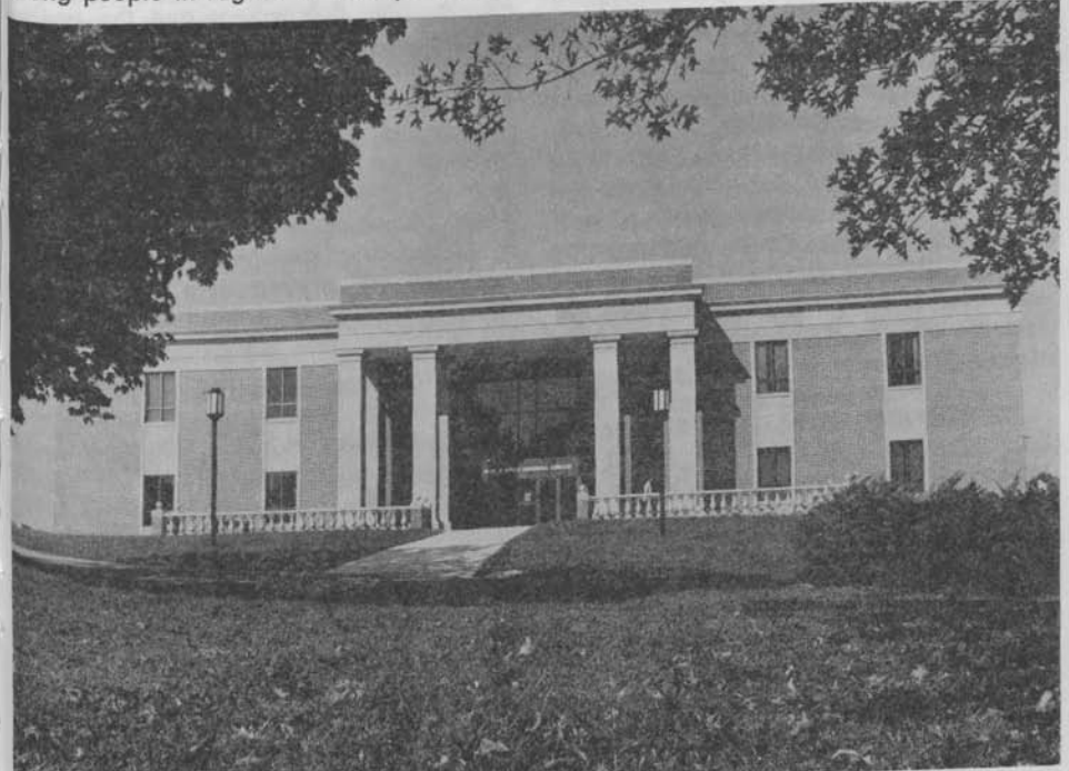
The John R. Dover Memorial Library, Gardner-Webb College, Boiling Springs, North Carolina, dedicated October 19, 1974.