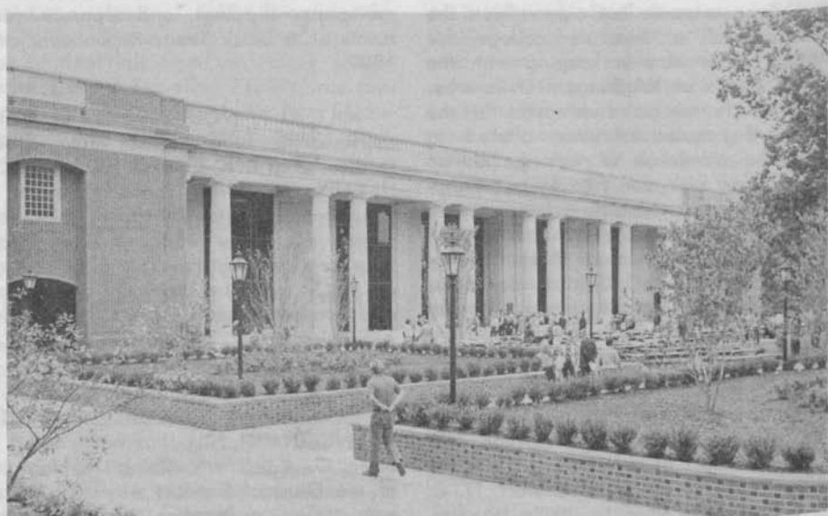
THE E. H. LITTLE LIBRARY DAVIDSON COLLEGE