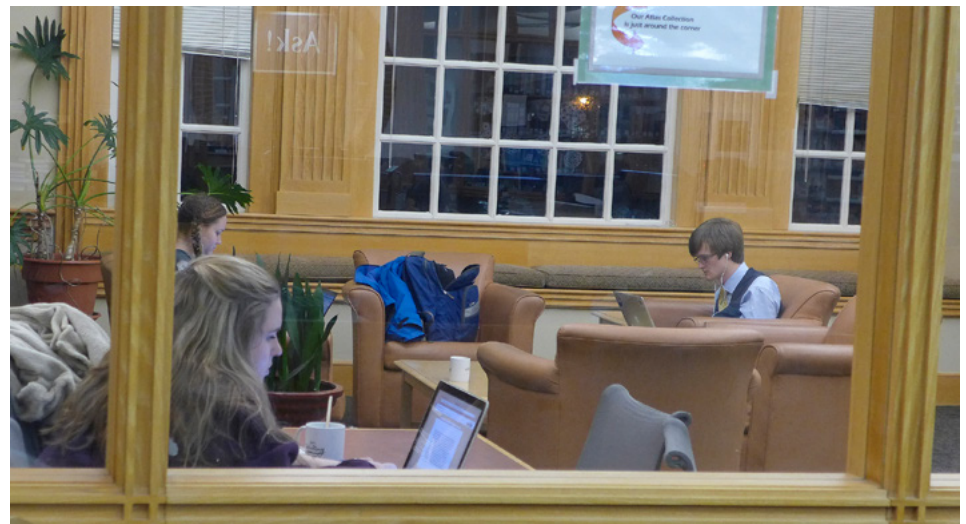
These student authors enjoyed being in the company of other writers while they worked throughout the evening.

Although students were encouraged to continue writing throughout the evening, they were allowed time after the end of the event to continue working on their pieces before final submissions would be due.