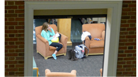
Setting up camp in the Reynolds wing! A student author sets up for a long night of writing.