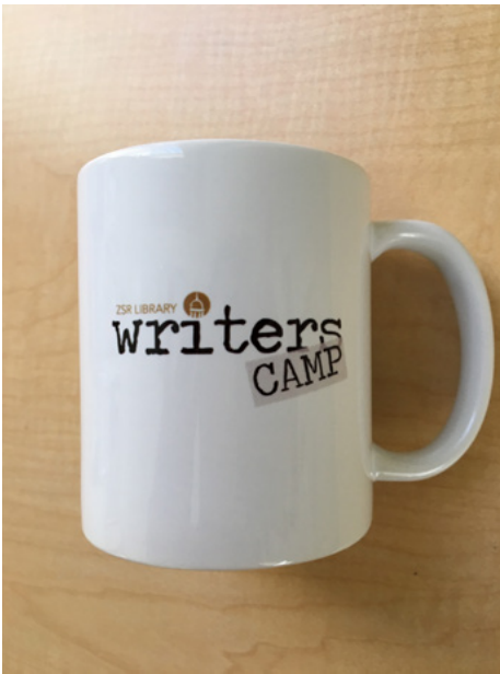
Every student author and Writers Camp committee member received a customized Writers Camp @ ZSR mug.