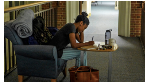
A Writers Camp author hard at work, writing late into the evening.

The event was shared on ZSR Library's social media channels and committee members were pleasantly surprised to see WFU Alumna and New York Times best-selling author Emily Giffin comment on the event.