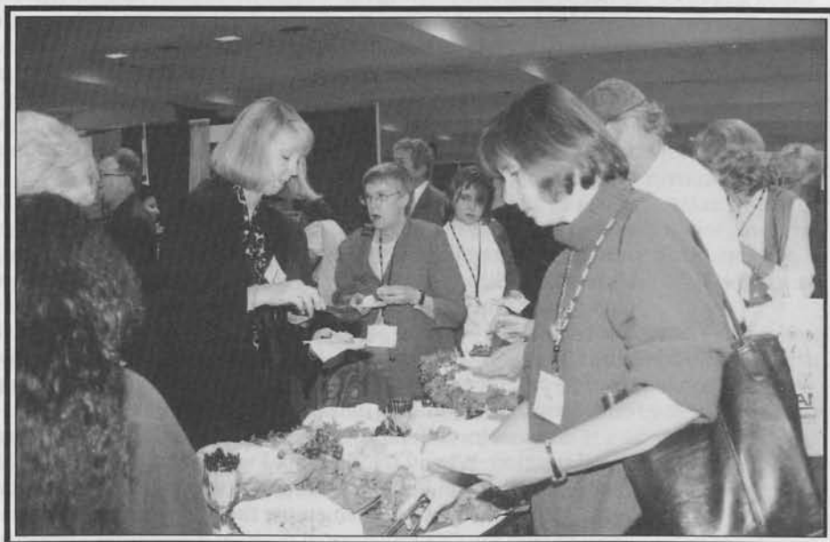
Vittles and vendors — a nice combination!

Advertisers: Baker & Taylor, 164; Broadfoot's, 163; Brodart, back cover; Checkpoint, 181; Current Editions, 183; Davidson Titles, 161; Ebsco, 169; Mumford Books, 180; Quality Books, 175 SIRS, front cover