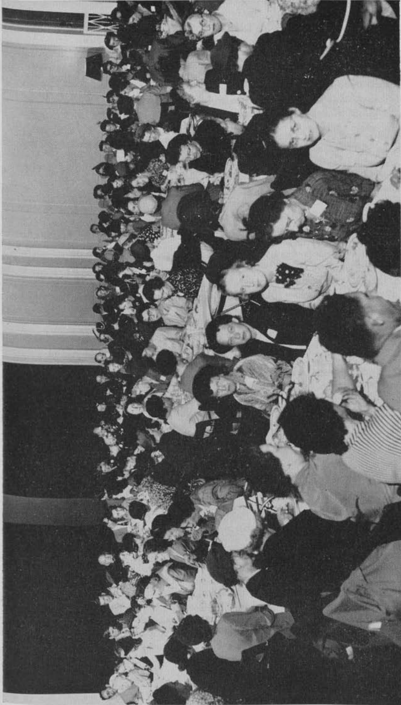
Luncheon honoring guests of the School and Children's Librarians Section of the North Carolina Library Association, Conference at Chapel Hill, September 20, 1952