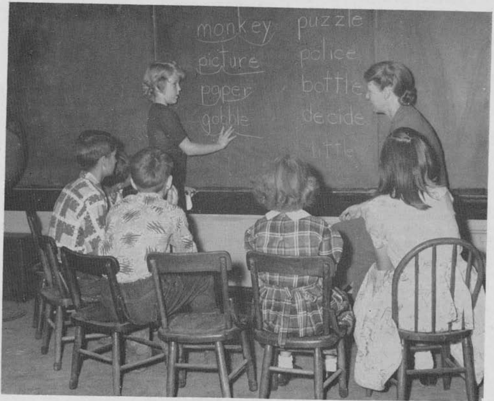
A small group being taught according to demonstrated needs of the pupils. Special reading classes, (Proximity School) Greensboro.

Librarians are interested in and concerned about reading inability; and rightly so. But, as a librarian, the writer became curious about why children failed to learn to read and about what could be done to help them. Leaving to others the fun of helping eager children find the right book, she became involved in helping children learn to read. For-saking a career as a school librarian, she made special studies in the teaching of remedial reading, and became a special teacher of reading in Greensboro Public Schools.