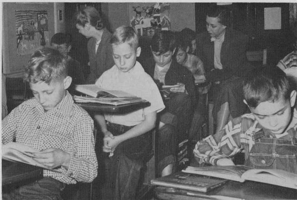
A regular classroom reading class with the reading specialist and the grade teacher giving individual instruction and guidance within the group.

Quinine is a useful tonic. Perhaps a dose of it won't harm you if you take it for a cold but more than likely it won't cure your ailment. If a child needs to learn the "sight words," reading a library book will probably not help him to distinguish between then and when . A reader who has good comprehension but lacks speed because of word-by-word reading is going to plow through his library books practicing his bad habits.