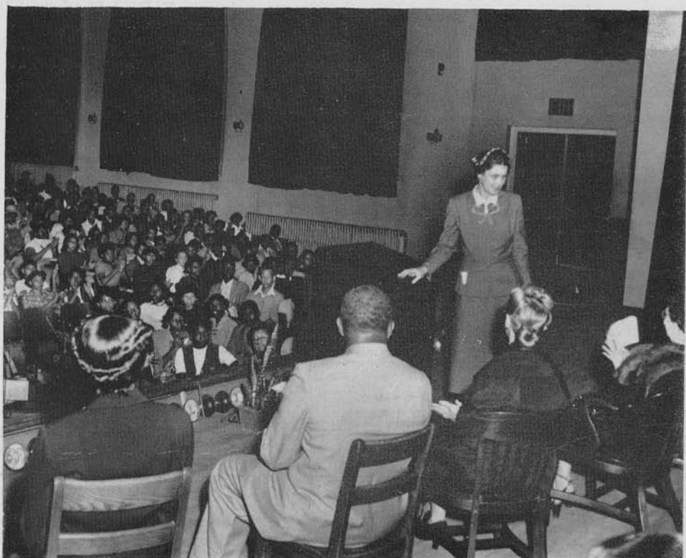
MRS. ELIZABETH JANET GRAY VINING

In the afternoons during her stay in Greensboro, Mrs. Vining was in Straughan's Book Shop where she greeted her numerous friends and autographed copies of her latest book "Windows for the Crown Prince."