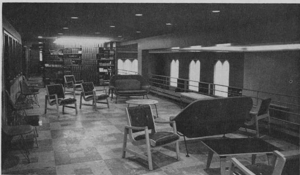
MEZZANINE—INFORMAL READING CENTER

The reading room to the left contains a browsing collection and special display cases for new books. Both informal chairs, and regular apronless tables, with chairs, are provided. Cataloged books in all fields are shelved in the stacks at this end of the building. In both reading rooms, cases and furniture are in blond birch and oak.