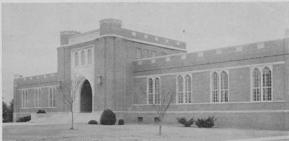
CATAWBA COLLEGE LIBRARY, SALISBURY, N. C.