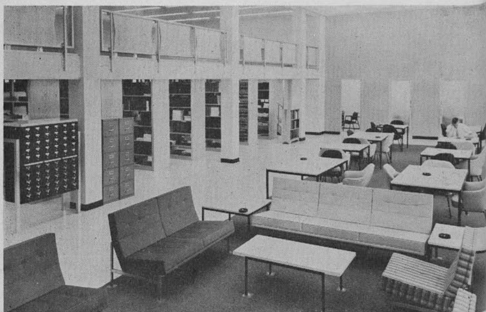
Chemstrand Library Interior

The library collection includes mainly mathematics, physics, chemistry, plastics and textiles literature, with emphasis on organic chemistry. The library subscribes to more than 300 periodical titles of which half are of foreign origin and about a third are in a foreign language. Although it is the library's policy to try to purchase everything which will be used by the Research personnel, we still obtain much material by interlibrary loan. During the past year 400 items were borrowed and the majority of the material came from the three neighboring libraries: Duke University Library, N. C. State College Library and the University of North Carolina Library. These libraries have graciously included the Research Center Library in their Interlibrary Center service which includes truck delivery of material three times a week. This service has been a great help in providing needed information for the library's patrons.