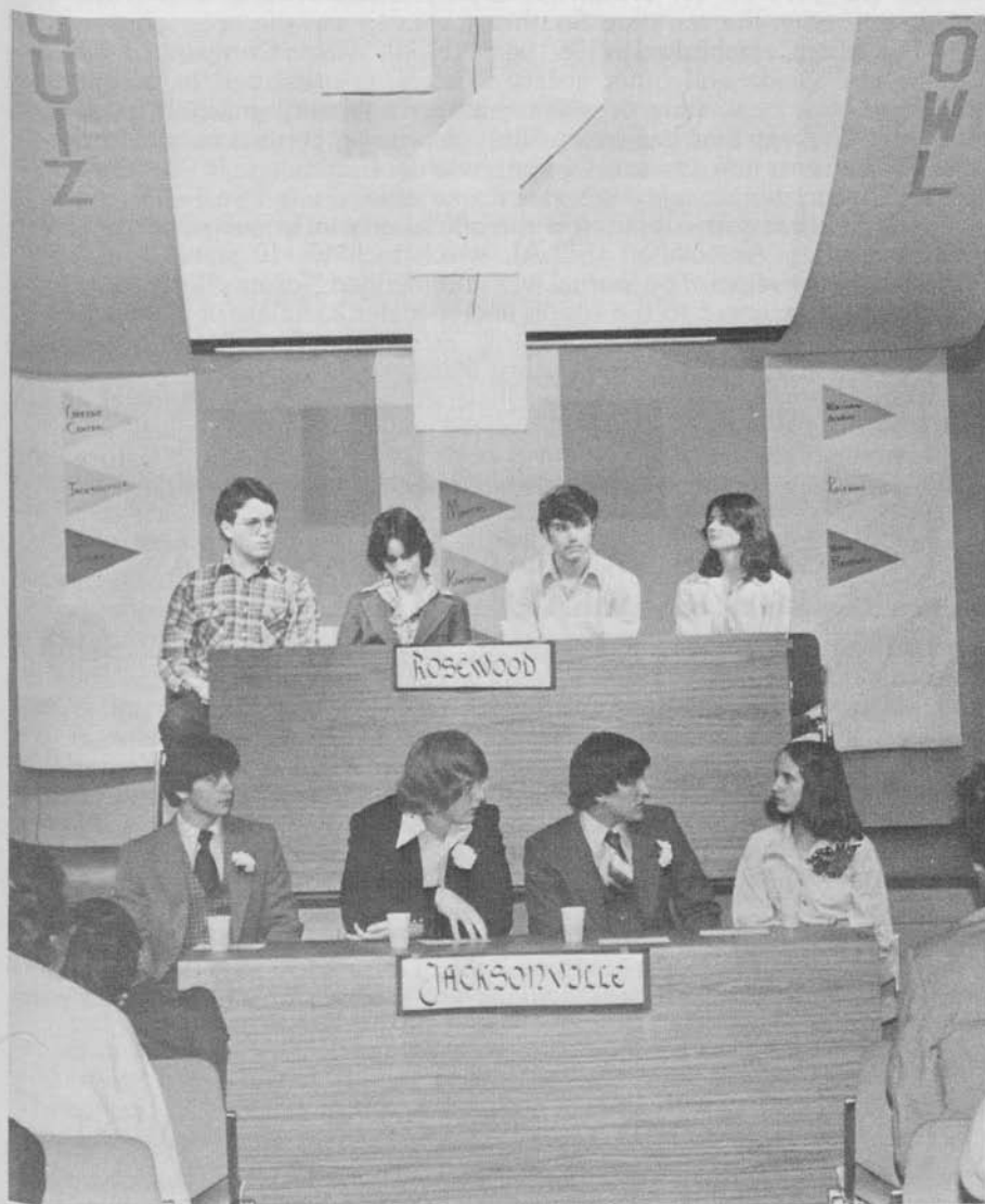
The Eastern North Carolina Quiz Bowl for high school students, sponsored by the Loose Region, was held at the Wayne County Public Library in April. The team from Wallace-Rose Hill (Duplin County) emerged victorious, defeating Kinston (Neuse Region) in the finals. Participating teams represented eleven counties and seven public library systems.